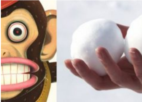
Origins of Cold as Balls and Cold as a Witch's Teet