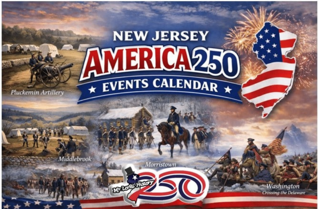
New Jersey America 250 Events Calendar