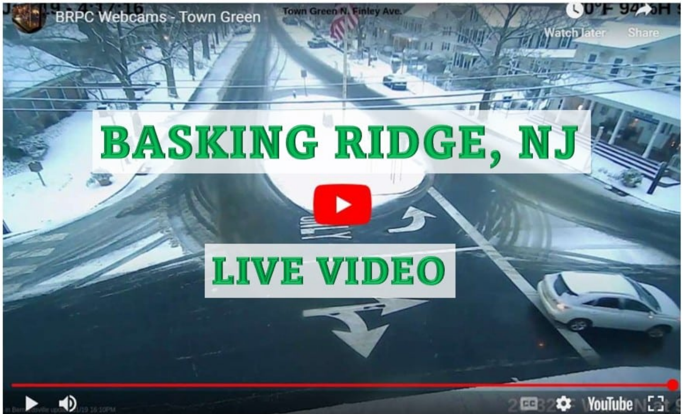
Basking Ridge Live Cam – Mr. Local History's Hometown