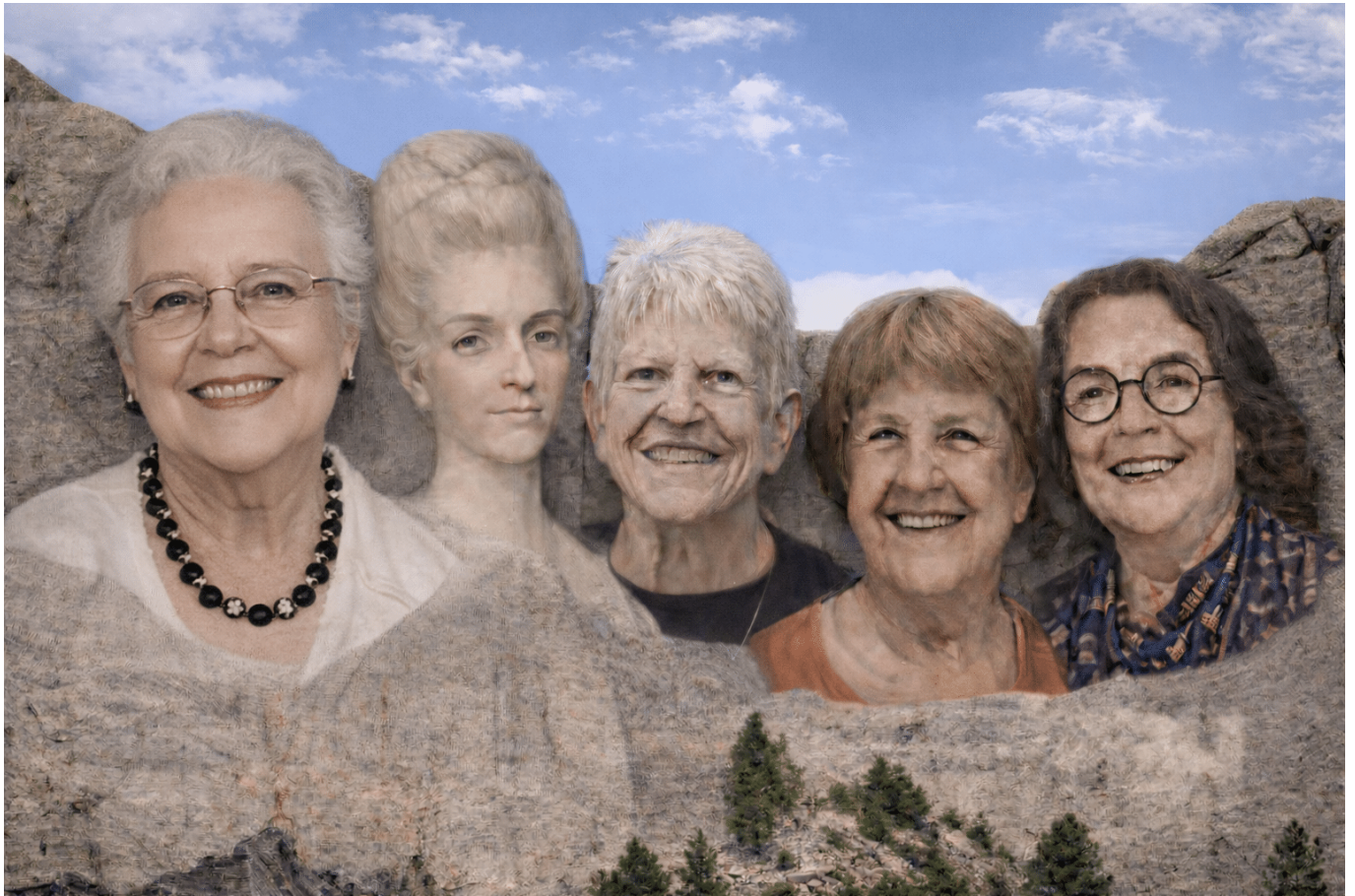
Basking Ridge's "Rushmore 5" Ladies Honored