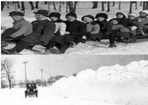
Snowstorm Records and Sledding in Somerset County New Jersey