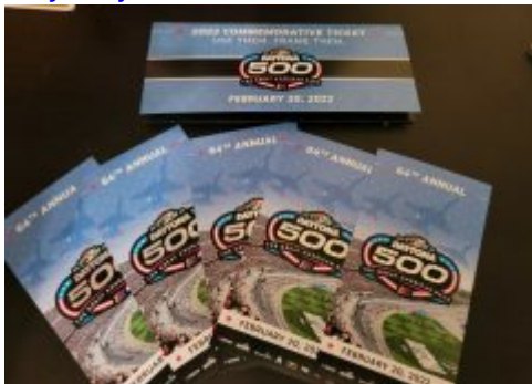
Daytona 500 Ticket Price History – 2026 – Holding Tight in a Less Inflationary Economy