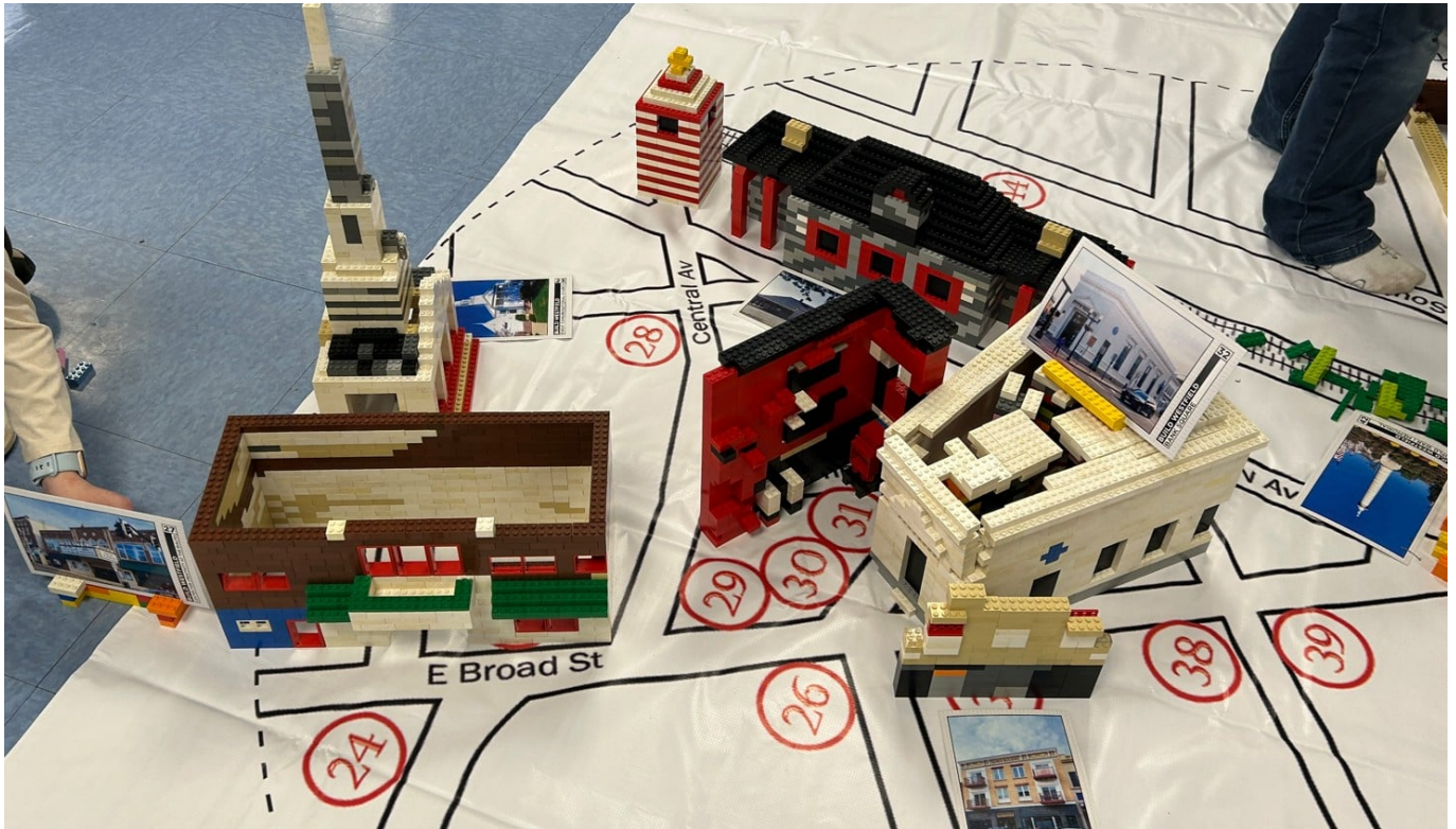
Westfield Builds a Lego Town to Celebrate America 250