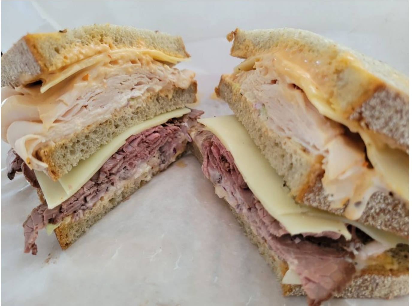
Brush's Sloppy Joe

If you were wondering, YES, the researchers paid for and ate every sandwich we photographed. Read the History of Brush's Deli to learn how each sandwich was named.