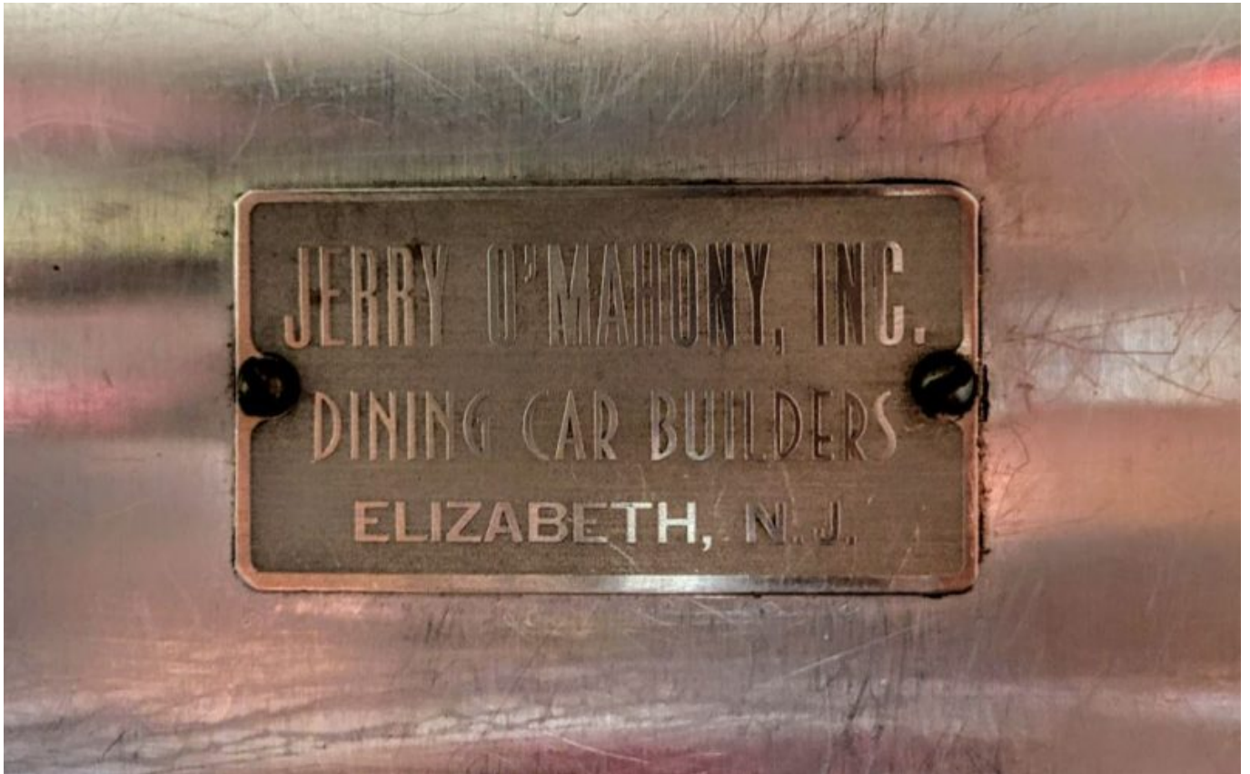
The iconic signature Jerry O'Mahony, Inc logo inside the entrance door.