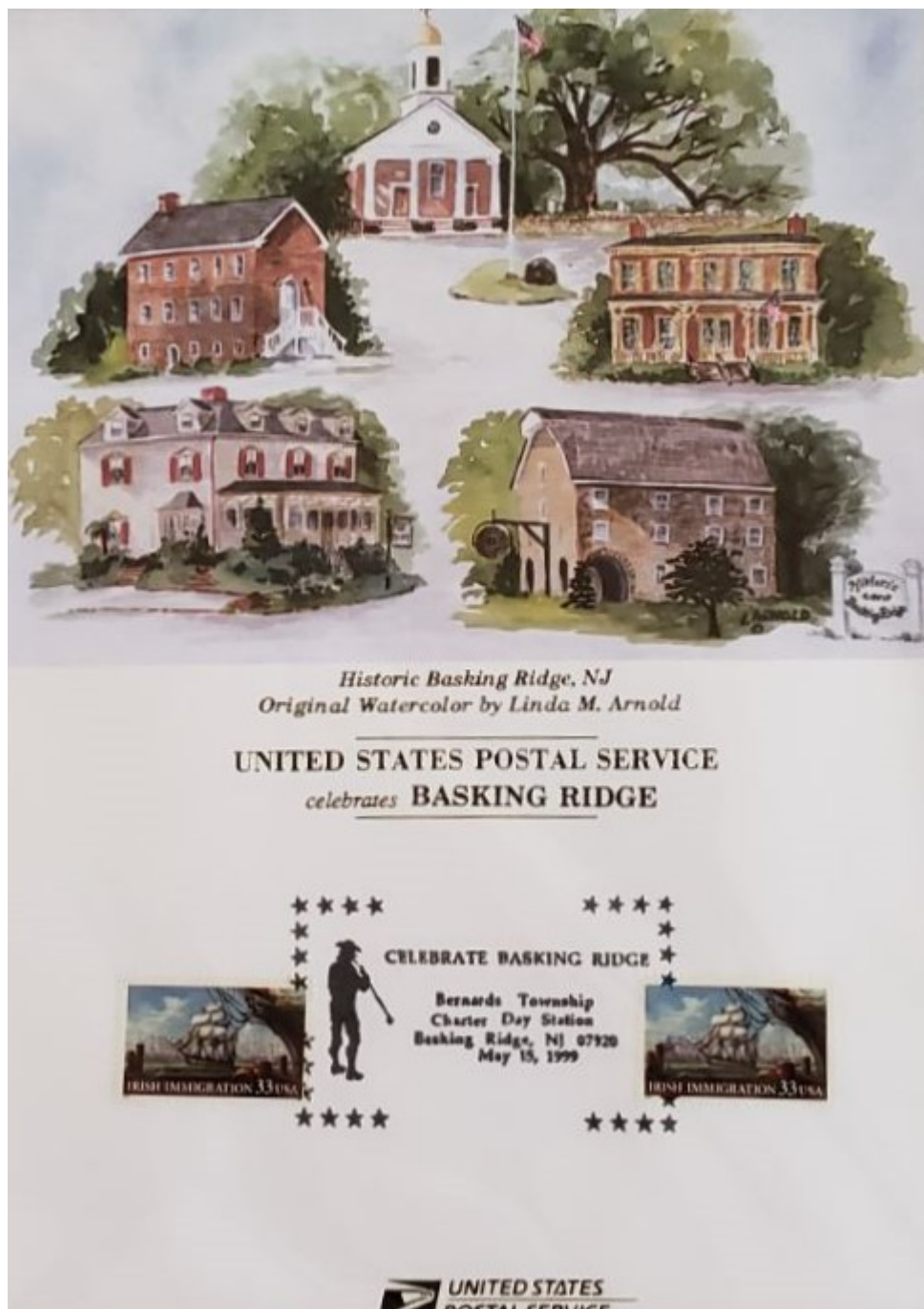
1999 USPS commemorative postmark